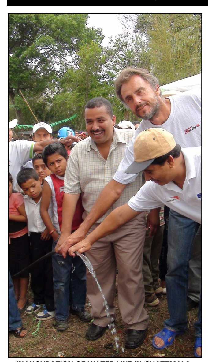
INAUGURATION OF WATER LINE IN GUATEMALA

The Wells of Hope initiative has been blessed with many successes during the 2010-2011 season. God has once again demonstrated to us that, with Him, the seemingly impossible does become possible.